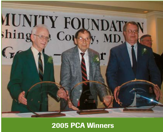
2005 PCA Winners